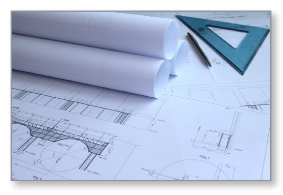
Modular buildings custom designed to meet your needs.

Our PMC buildings are typically identical to their traditionally built counterparts in capacity, accommodation, features and comfort. We adhere to the same building standards and utilize the same materials and hardware that go into traditional site-built structures, but with the advantages that come from off-site