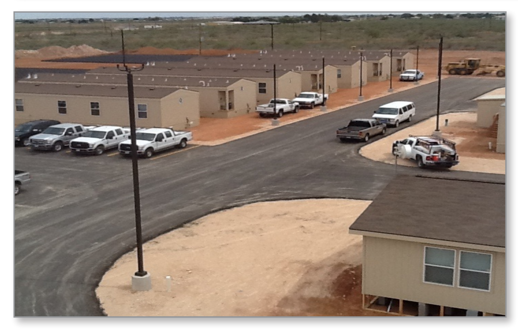
Build to suit from 30 to 400 person camps.